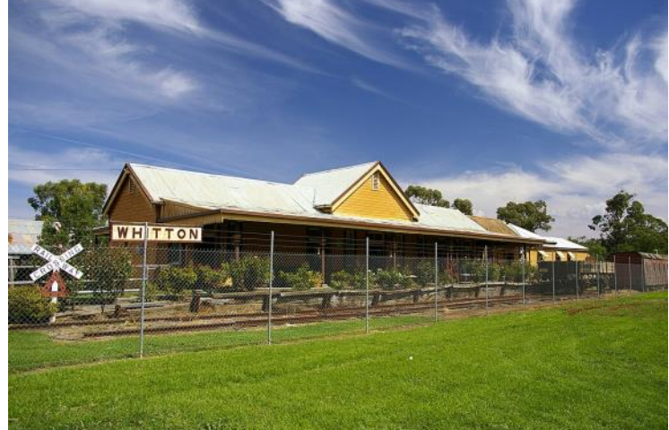
Above: Railway station building at the Whitton Museum

During 1880s-1900s Whitton Railway Station received wool and wheat from Pastoral Stations north towards the Lachlan River mainly around Cargelligo and Euabalong. Copper ingots were also carried to Whitton